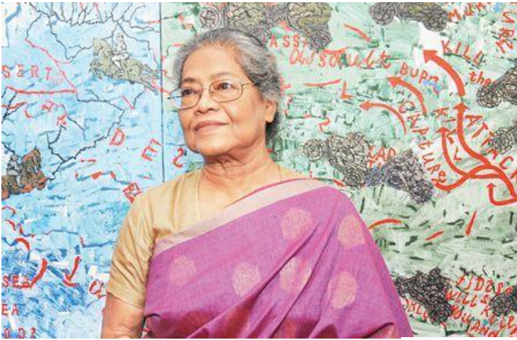
The artist fronts her canvas