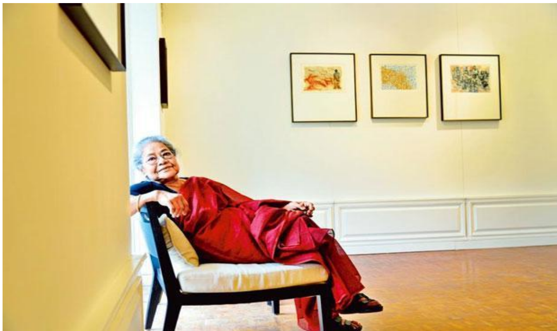
A superb short of artist and artwork frames in creative perspective